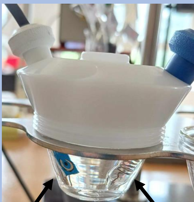
Fig. 2: AC1.W4.R1 sensor with EXTERNAL reference Ag/AgCl electrode in TC6 cell with KCl solution

The electrochemical conditions of a stable reference electrode are met - the external reference electrode is separated from the measured solution by a liquid interface (frit) and the silver wire of the reference electrode is coated with AgCl.