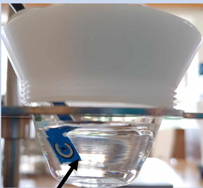
Fig. 1: AC1.W4.R1 sensor in TC6 cell with KCl solution

The electrochemical conditions of a stable reference electrode "are not met". The printed reference electrode (R1) has no internal electrolyte and no liquid junction. This is not an error but a feature - or rather the behavior of the printed reference electrode