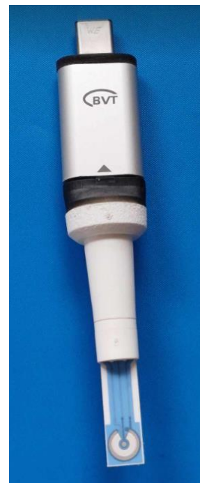
GALVANO PLOT.C1 with AC1. sensor